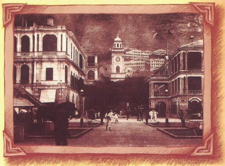
Pedder Street, Central, circa 1890