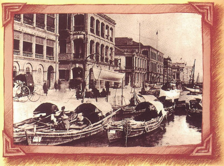
Queen's Road, Central, circa 1870