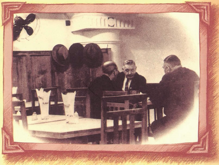
Jimmy's Kitchen, circa 1946