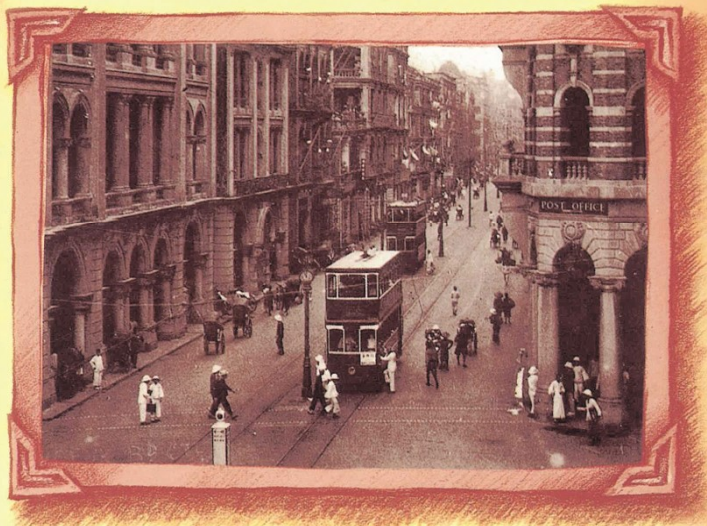
Des Voeux Road, Central, circa 1900